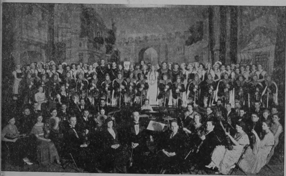
OPERA "FAUST," PRESENTED BY STUDENTS OF MUSIC DEPARTMENT

Certain rules relative to scholarship govern those students who are working outside of school hours. You should acquaint yourself with these rules by consulting with the respective deans before making any definite plans for work.