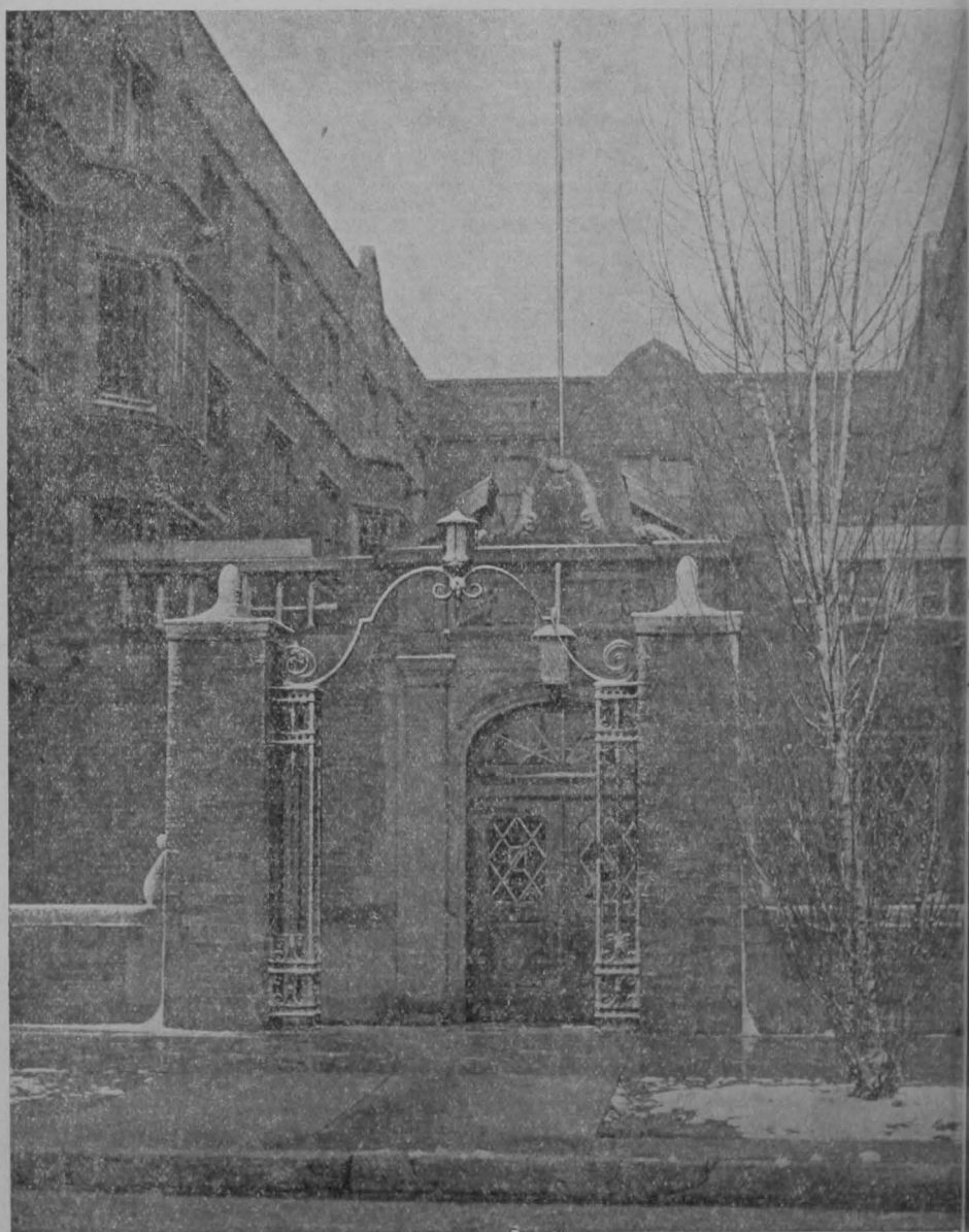
ENTRANCE TO RESIDENCE HALL